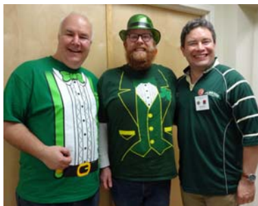
A good time was had by all.