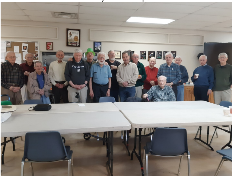
March Grey Gosts Group