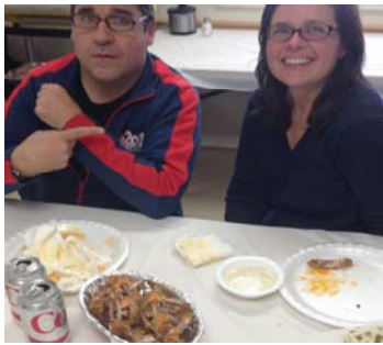
Which Ward ate all them wings?