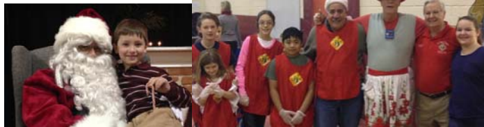
Everybody loves Santa Breakfast