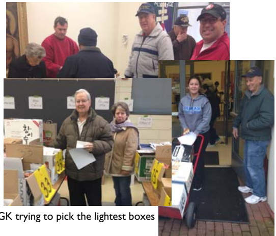
GK trying to pick the lightest boxes