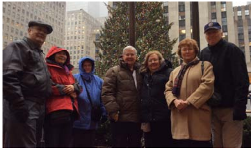
Plumstead's, McGuire's, Baringhaus, & Eldred