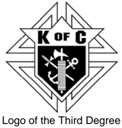
Logo of the Third Degree

Privileges of being a Third Degree Knight include the honor of serving as a local council officer, and admission to state and Supreme Council business meetings. First and Second Degree members can attend the state and supreme Council meetings, but they are not allowed in the business sessions.