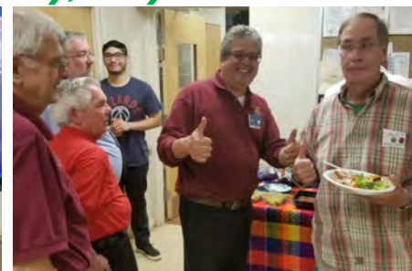
Knights enjoying real Mexican food.