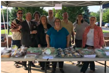
Knights & Ladies selling baked goods.