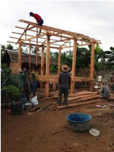
Each family assisted with the construction of their new home called a bahay kubo.

There is still great need for reconstruction in Carles including repairs to Sitio Gua Chapel that was severely damaged during the typhoon. They are trying to put a roof on the chapel before Holy Week. If you would like to contribute to this effort please contact Thelma at 703-323-6470.