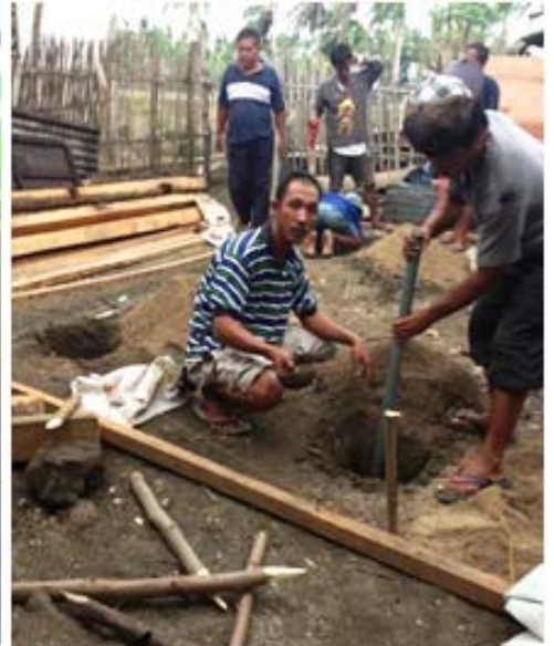
Digging the footings for one of the ten new bahay kubos constructed.