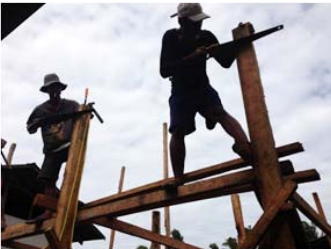
Each new bahay kubo cost $475.