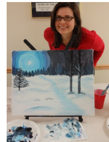
Beth Ward's Painting