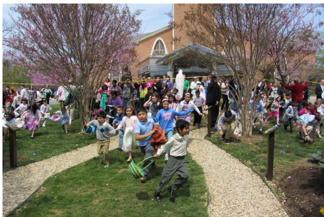
After the rope holding back the kids was raised excitement breaks out as they all race for the eggs.