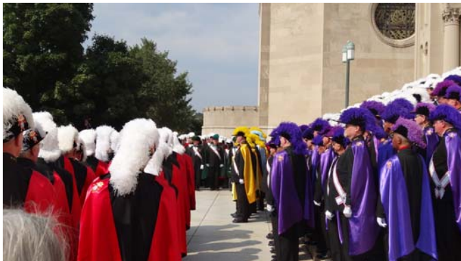
Over 500 Knights of the Fourth Degree were present at the 50th anniversary celebration of the Knights Tower Carillon at the Basilica Of The National Shrine. This event took place on Sunday, September 8, 2013.