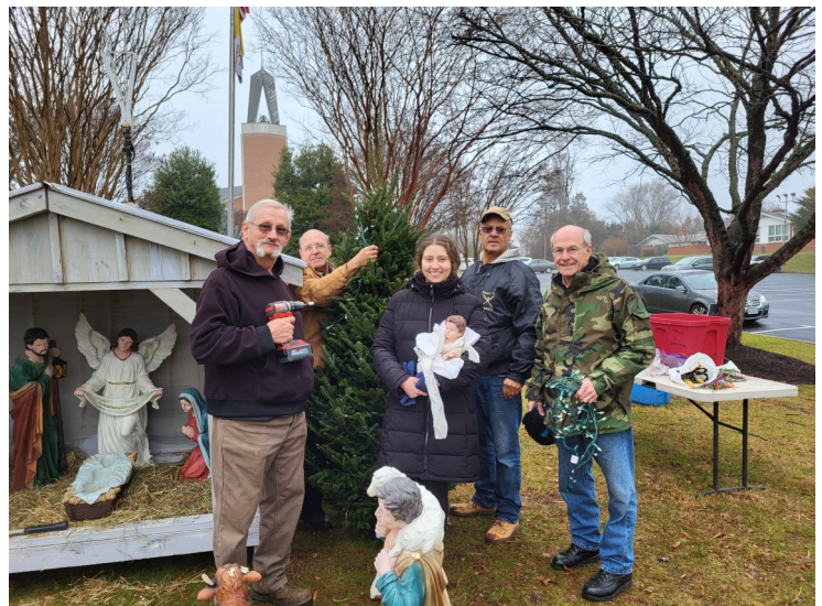
Creche Setup 2024