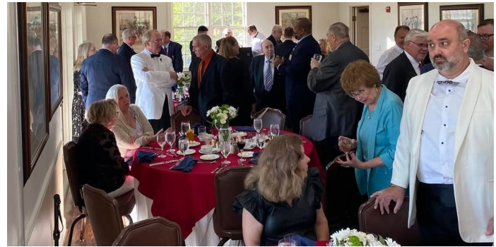
4th Degree Memorial Day mass with the Bishop