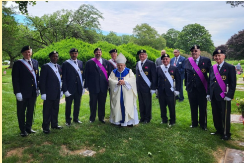
Grand Knight's Ball