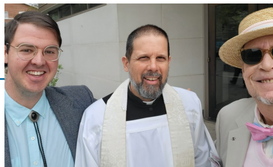
Easter Mass with our Pastor