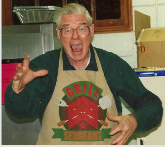
Wild-Man—King of his Kitchen