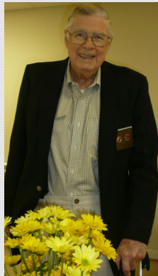
At the Hall Dedication