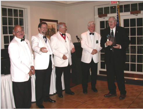
Receiving the Robert D. Neary Award for Dedicated Service to Church, Community, and Family through the Knights of Columbus