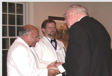
Big Man—Big Heart—Loved by All