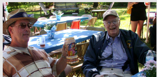
Holding court at the Oktoberfest—is that water he's drinking?