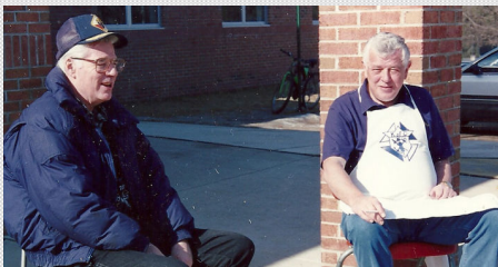
Working Hard—taking a break