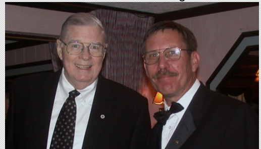
Always smiling—dresses up nice too!