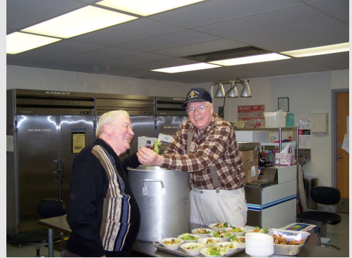
Great fun in the kitchen—all the time !