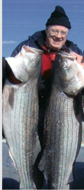
Always after the "Big Ones"