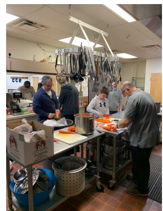
The carrot cutting team