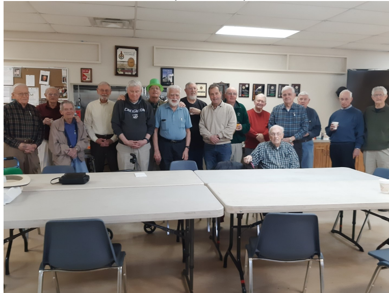
March Grey Gosts Group