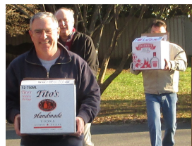
"Baskets" of food delivered to 75 families in the parish