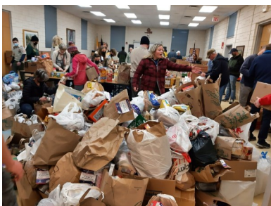
The 2021 Scouting for Food Heap. Over 12,000lbs!!!!