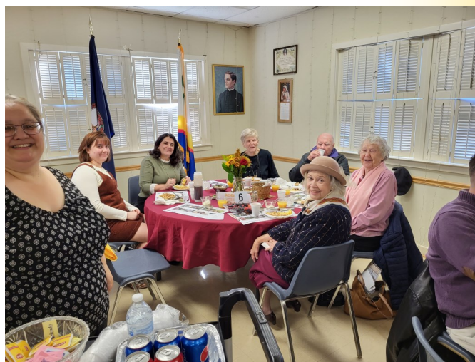
Family and Widows Breakfast in November