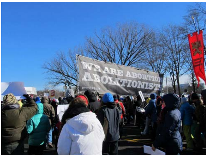
This banner near the start of the parade has letters that are big enough that the message is quite clear for all to read.