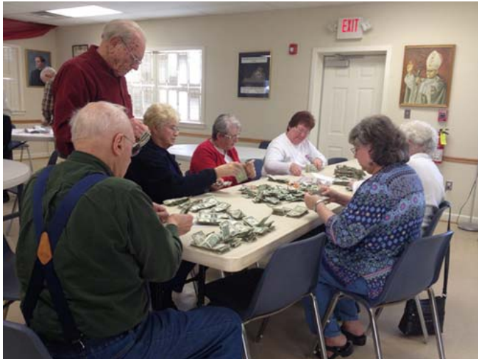
After the march two tables of busy counters tallied the donations. 100% of donations go directly to the March For Life Education and Defense Fund.