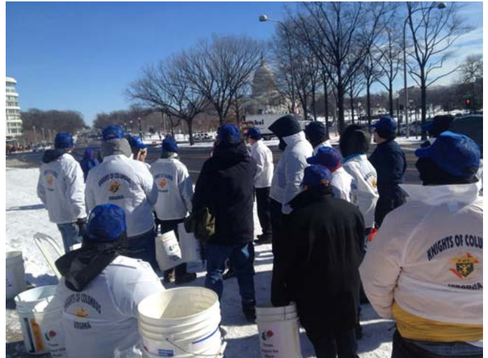
Just before the march started all the collectors took the opportunity to participate in a moment of prayer.