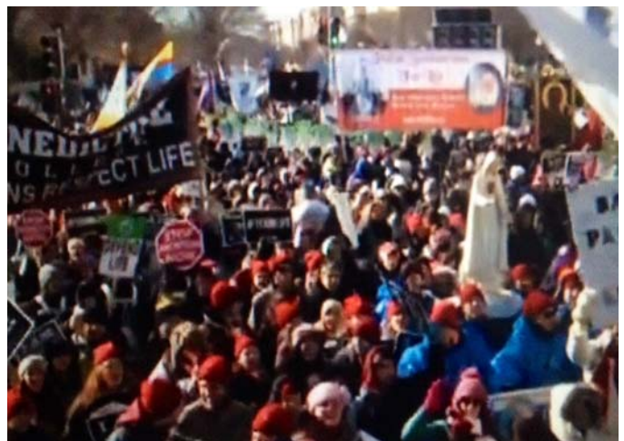
Even with the freezing cold temperatures the crowd size was amazing.