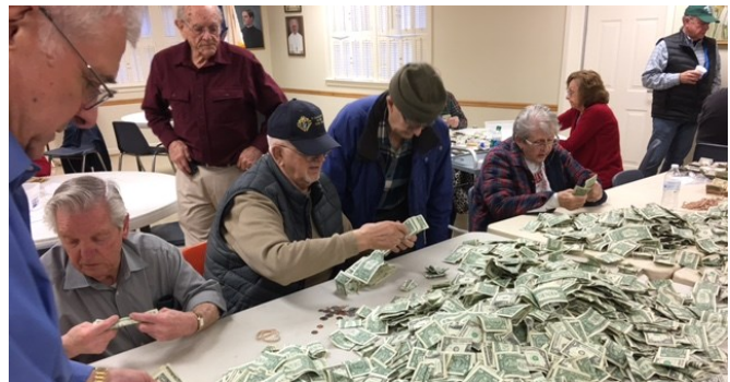
Many dedicated, hard working volunteers were on hand to help count the money after the Right-to-Life March on January 27.