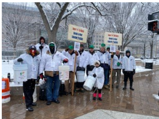
March for Life 2024