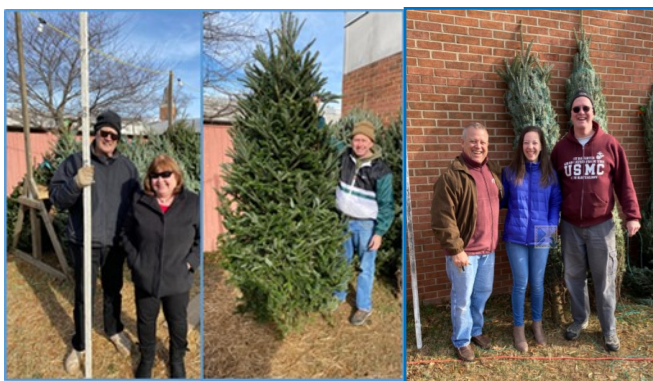
The weather has been great for tree sales.