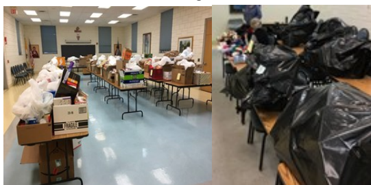
Our Council assisted St. Leo's Social Ministry in delivering boxes of food and bags of gifts to over 50 homes.