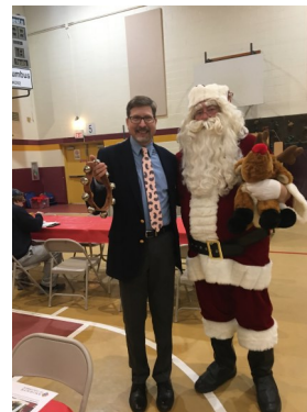
Santa even checks on the Grand Knight to see if he was good throughout the year.