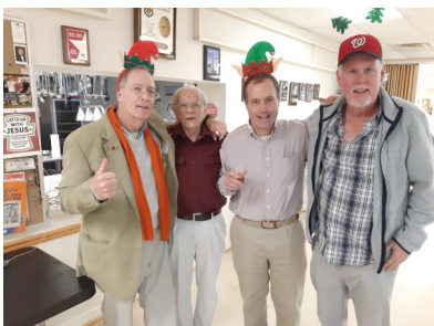
← Brothers enjoying the holiday seasons together.