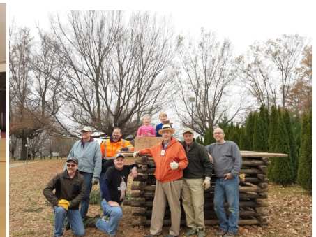
After a long day of selling Christmas trees, fellow brother knights pose for a picture