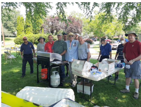
Brother Knights cooking at the Fairfax Government Employee picnic