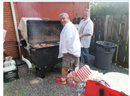
Cooks for our Annual Steak Night