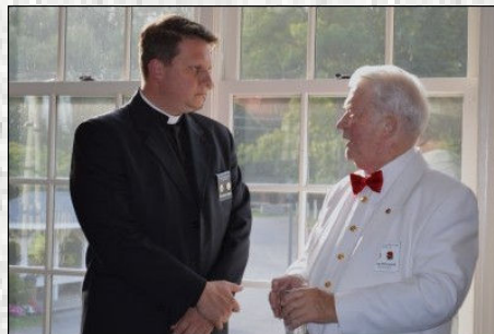
Grand Knight and Chaplain