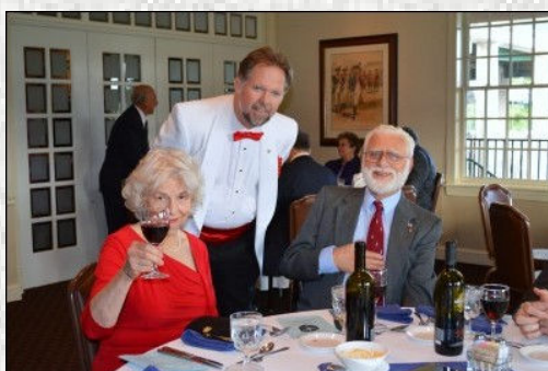
Happy Knights and Wives En- joying the Spe- cial Evening.