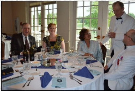
Cocktail Social Hour