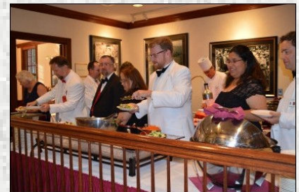
Dinner line getting crowded—great Prime Rib!!