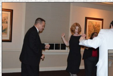
Dancing the Night Away!