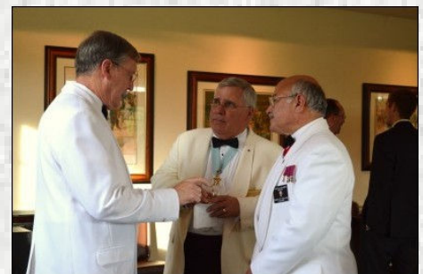
State of VA Officers