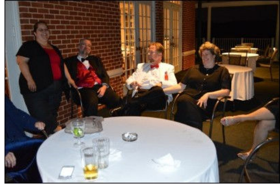
Dancers and non-dancers at this Years Grand Knight's Ball. See More pictures on Page 8