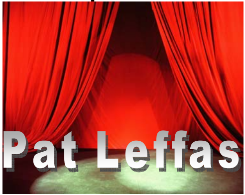
Family of the Month April 2007