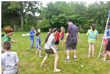
Kids Playing games