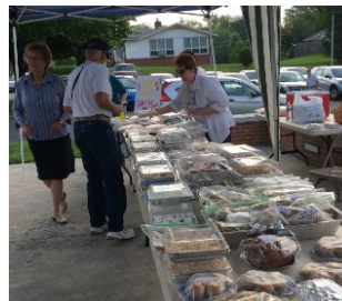
Getting ready for the after mass crowds