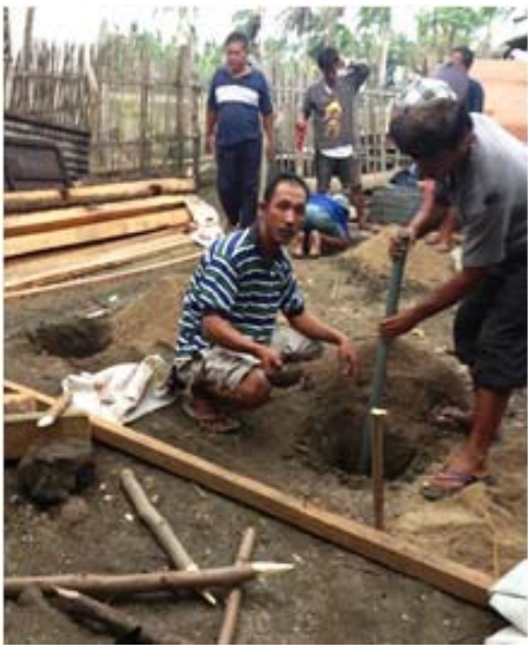
Digging the footings for one of the ten new bahay kubos constructed.