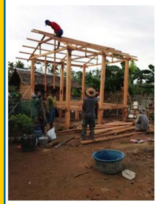
Each family assisted with the construction of their new home called a bahay kubo.

There is still great need for reconstruction in Carles including repairs to Sitio Gua Chapel that was severely damaged during the typhoon. They are trying to put a roof on the chapel before Holy Week. If you would like to contribute to this effort please contact Thelma at 703-323-6470.