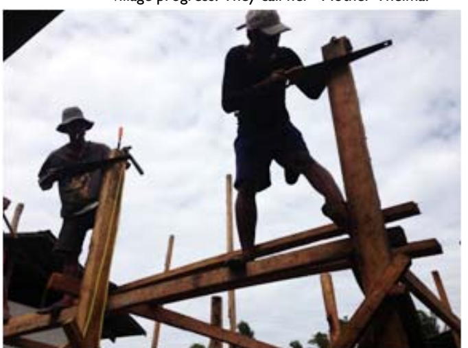
Each new bahay kubo cost $475.