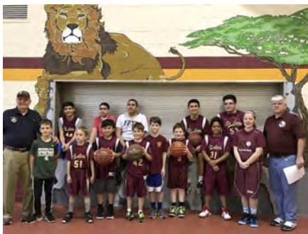
Participants from the Knights of Columbus District Free Throw Contest held February 11th