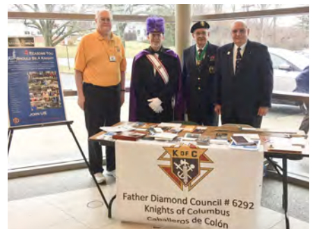
Recruitment Drive held at all masses the weekend of February 24th and 25th