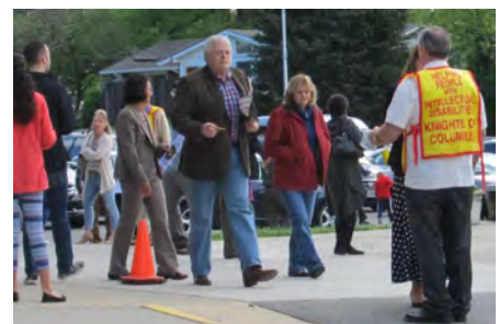
After mass collections