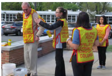
Confirmation class helping