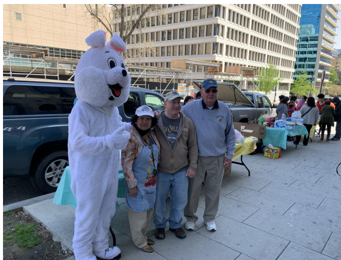
Easter Bunny paying a visit to Feed the Homeless in DC.