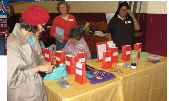
The ladies were very Active in October—Amish & Atlantic City Trips and Craft Fair