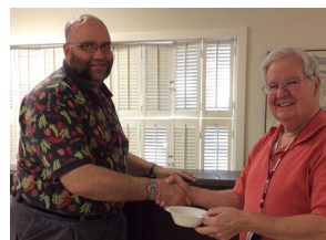
Chili Cook-off Winner & Judge