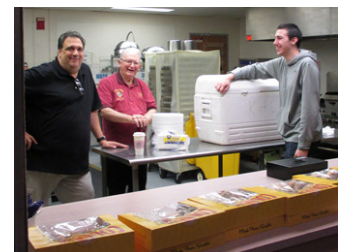
KofC Concessions at the Ladies Craft Fair