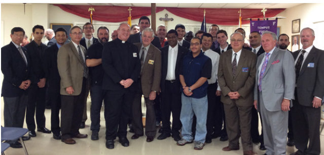
One of our largest 2nd Degree Classes in a long time!