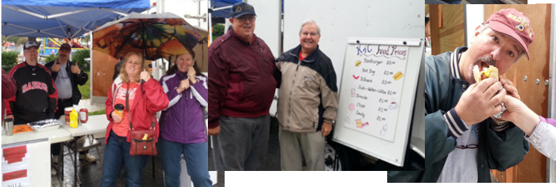
Some of the over 20 Knights and wives having fun at the Fairfax Fall Festival—in the rain. We can have fun anywhere!