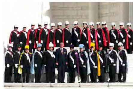
Honor Guard from Wreath Laying