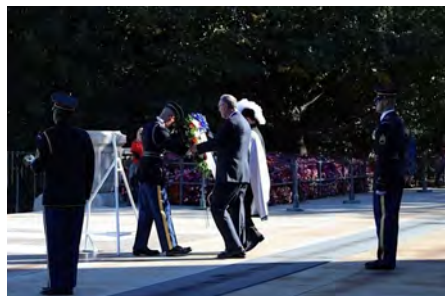
Laying the Wreath