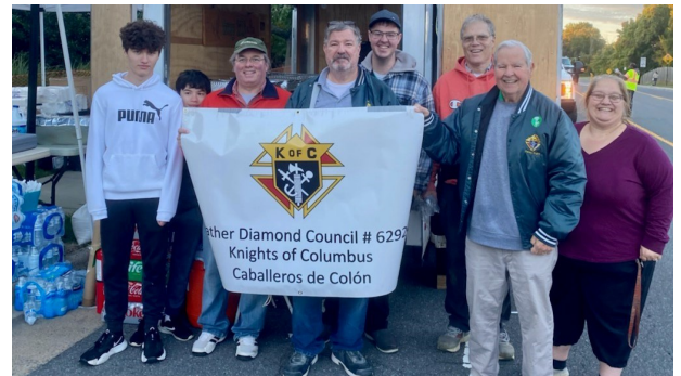
Fall Festival 2022 Helpers Morning Crew

Finally, If you know of any Catholic Man that would be a good candidate for our council, reach out to him or let me know by email jth1ogan3@gmail.com or call 703-731-7164. Remember many hands make light work.