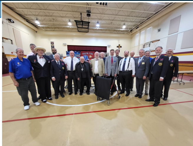
Brother's in action after helping out at the September 11 Mass.