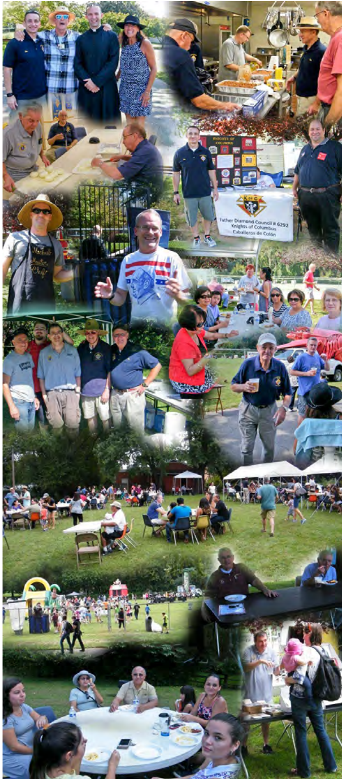
Parish Picnic on September 16th