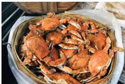
Great looking crabs!