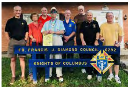
Some of the Crab Feast Crew