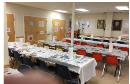
Artwork from the kids