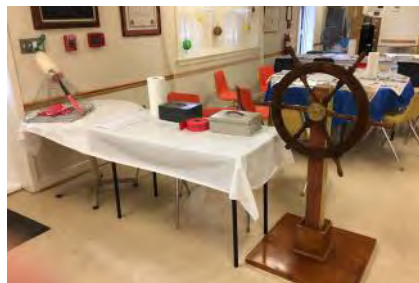
Set up and ready for crab feast