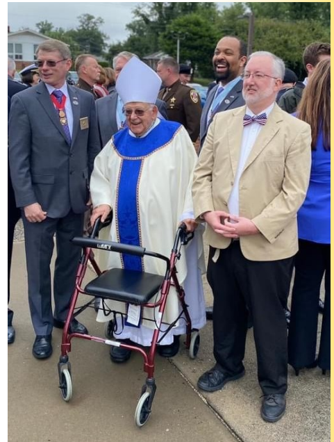
Photo from the Heroes Mass