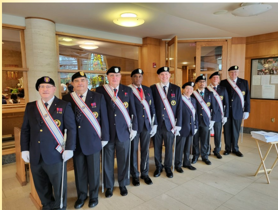
Honor Guard at the Heroes Mass on September 11