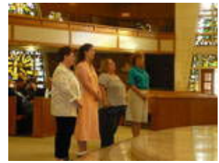
Also installed at that time were the new officers for the Columbiettes