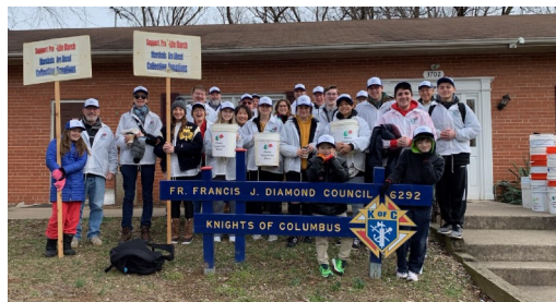
29 Brother Knights, wives and Paul VI Students ready to board the bus and Marshal at this year's March for Life. Several other Knights joined us downtown.