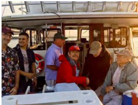
On the way out during the annual fishing trip on May 23