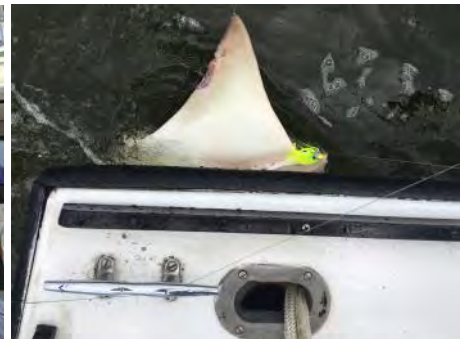
Sting Ray caught