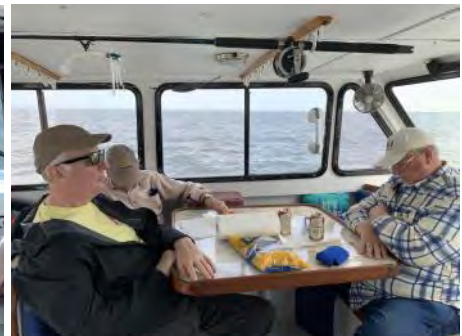
After a tough day on the water...zzz