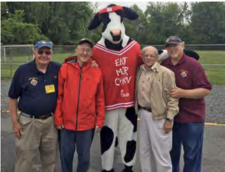
Having fun with the Chick-fil-A cow at the Run 4 Education on May 9